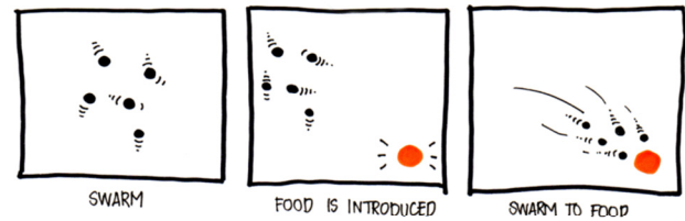
Figure 2: A sketch of a naïve swarming behavior. Fireflies will move towards a food source when food is introduced.

Groupings of fireflies can be made with predefined sorting categories based on the participants' demographics. The right-hand side of the visualization shows a list of available sorting categories ( location, age-range, knowledge, and attitude ). Clicking on each will group the fireflies into clusters based on the category. Another way of grouping fireflies is to perform textual queries, for example, by typing “province=alberta” in the query box. Lastly, clicking on fireflies will pull other fireflies that are similar to it. Similarity is currently determined by participant age-range and knowledge level,