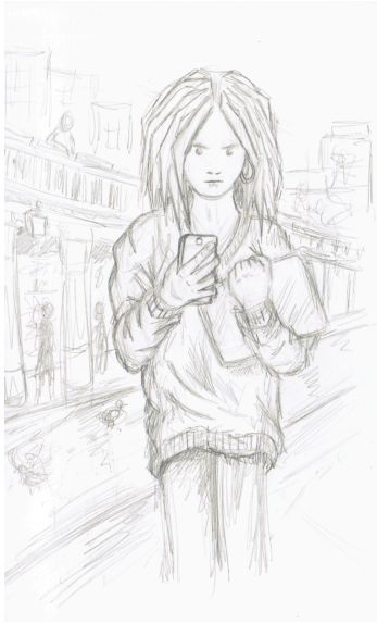
Figure 1: Ideation in progress. A person walking in an urban environment takes a moment to contemplate her mobile device and ideate about possible visualizations.

there are untapped opportunities for visualization and interaction techniques for mobile that have yet to emerge. We devised and used a design process to help us think of possible visualizations that are specifically for mobile devices.