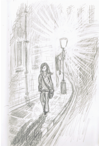
Figure 3: The result of having used light my way is a comfortable walk home on a well-lit street.

between friends? One could send a prescribed message such as “where are you?” to a friend who had previously agreed to share location information. Then, in turn receive a map displaying both your and their current location. The single message triggered location share could reduce repeated polling, while still providing the desired information.