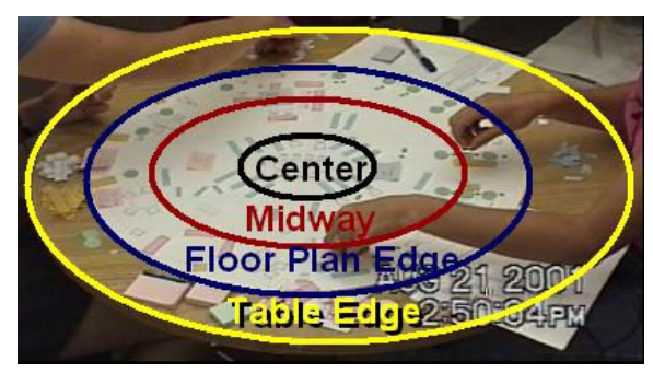
Figure 2. Radial Zones.

Though no group explicitly discussed reserving these areas for anyone's personal use, participants performed very few, if any, actions in their collaborators' personal territories (0%-13% of participants' actions). Thus, it appears that understood social norms dictate that the tabletop area directly in front of someone should be reserved for use by that person.