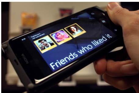
Figure 4: Social Network data can be used as recommendations.