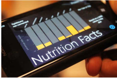
Figure 2: Nutrition facts will show up as a detail on demand when a person taps over the highlight –revealing information as to why a food item is recommended.